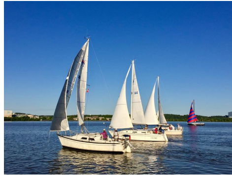
Volume 1, Issue 2 February 2018